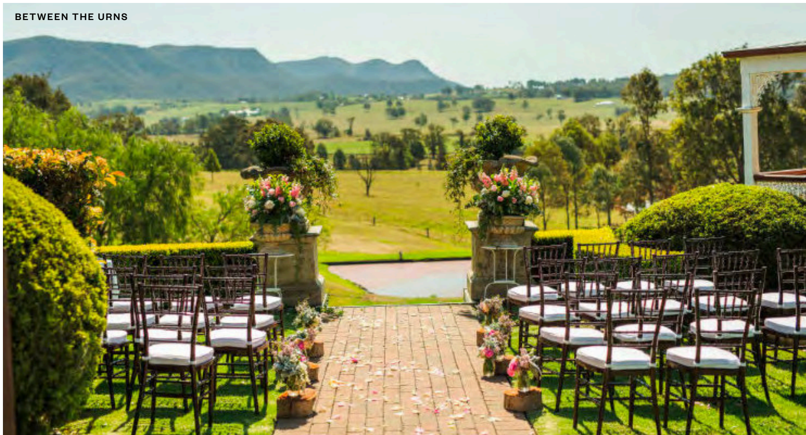
BETWEEN THE URNS