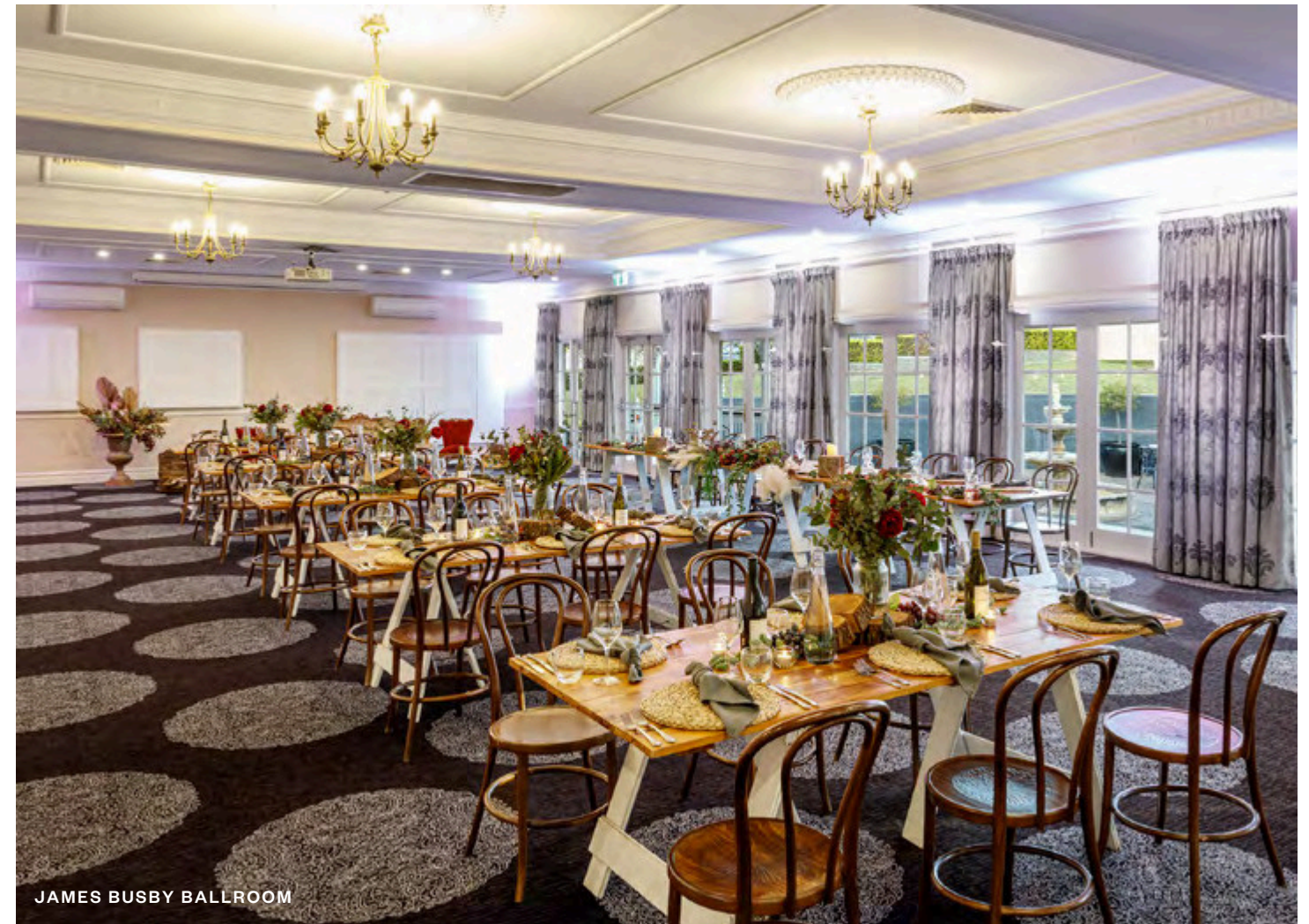
JAMES BUSBY BALLROOM