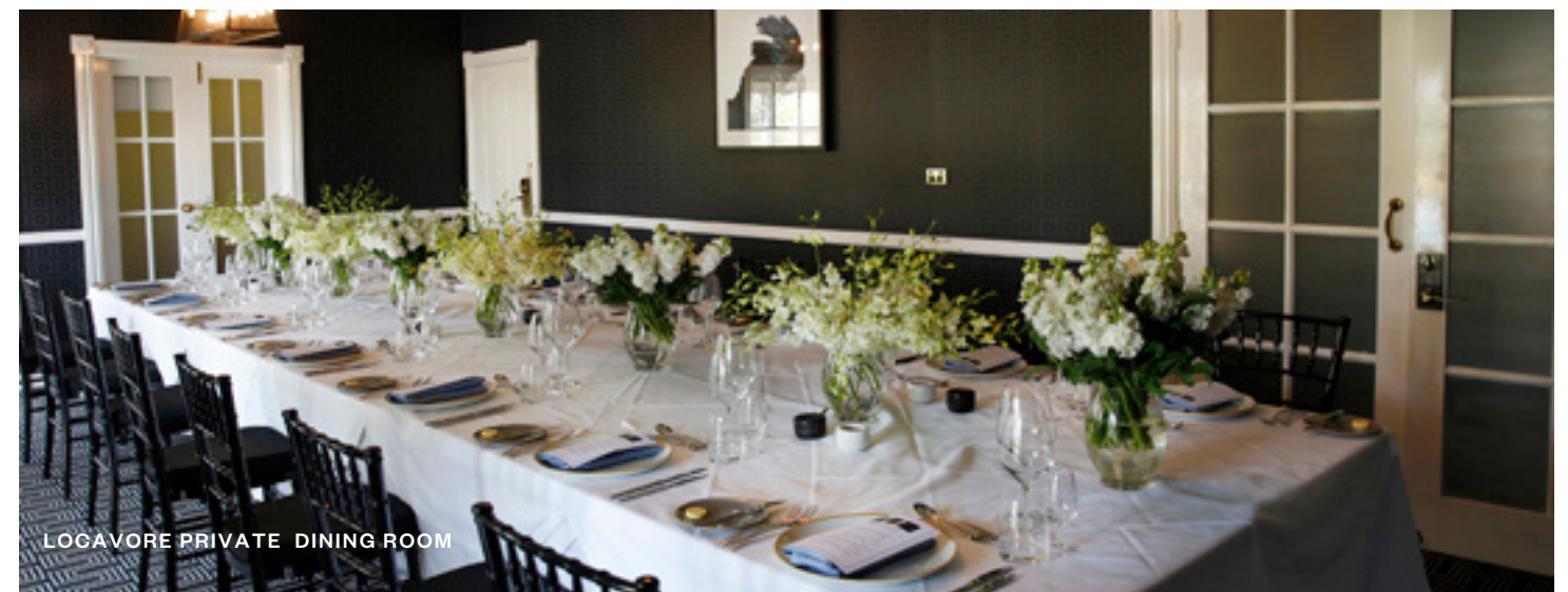
LOCAVORE PRIVATE DINING ROOM