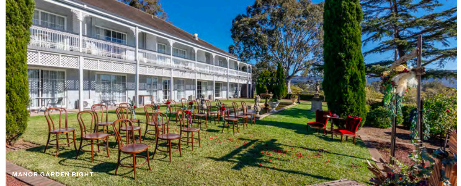
MANOR GARDEN RIGHT

CHOOSE ONE GARDEN LOCATION. EACH GARDEN CEREMONY COMES WITH SEATING FOR 40 GUESTS, A SIGNING TABLE, A REFRESHING WATER STATION, EASEL AND FRAME WITH SIGNAGE, AND BEAUTIFUL WET-WEATHER ALTERNATIVES.