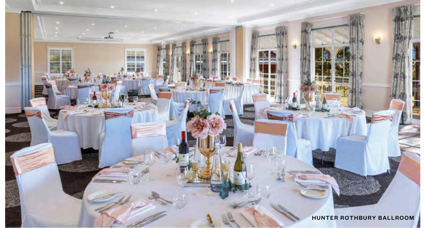
HUNTER ROTHBURY BALLROOM

The Hunter Rothbury Ballroom has an impressive entrance for your guests with high ceilings and a wrap-around balcony with stunning views of the Hunter Valley. There's space for up to 150 guests seated plus room to dance to music from a live band.