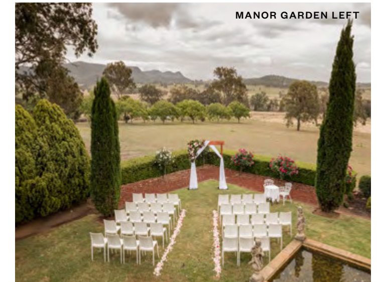
MANOR GARDEN LEFT