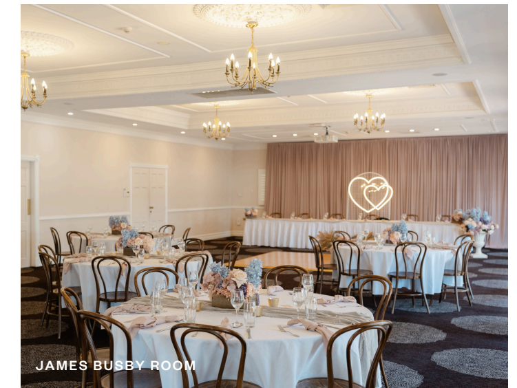
JAMES BUSBY ROOM