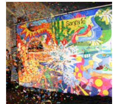
THE BIG PICTURE

Whether you're looking to break down barriers, drive performance, give back or simply have fun, Be Challenged have the program to suit.