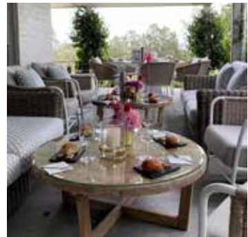
GAME, SIP & MATCH

Offering the luxury of a private night time wine experience in the comfort of your accommodation.