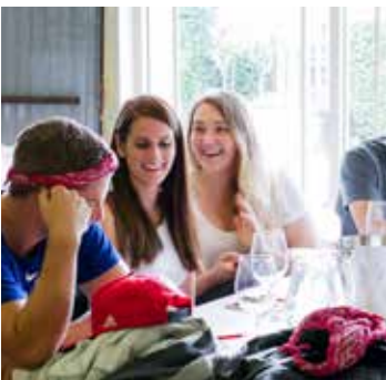
GRAPE TO GLASS