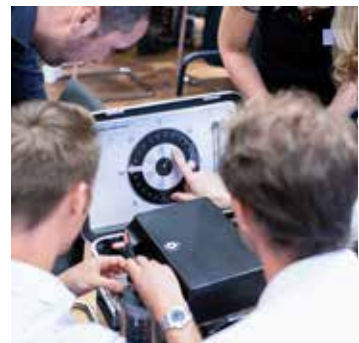
BEAT THE BOX

Ph: 1300 723 476 | E: Team@bechallenged.com.au | W: https://bechallenged.com.au/