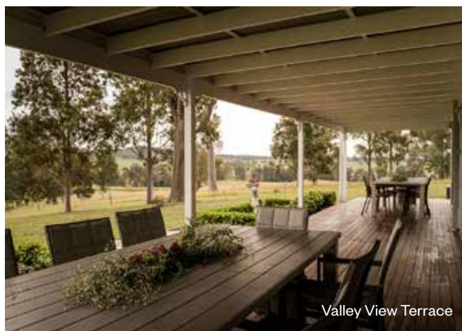
Valley View Terrace