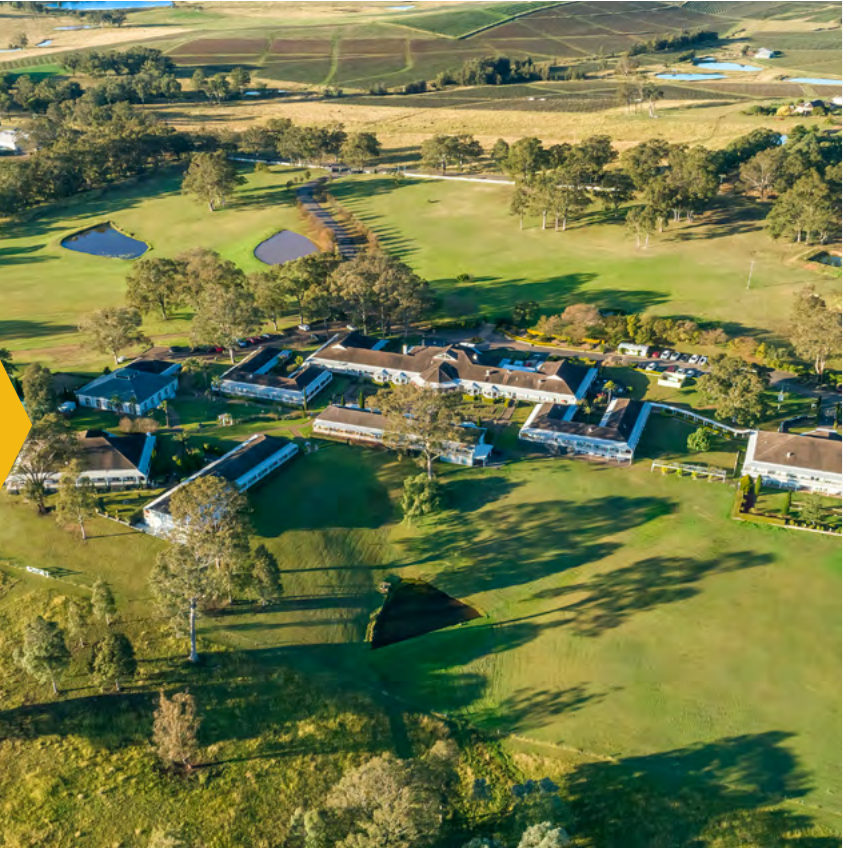
Entire Kirkton Park Estate

Accommodation Exclusively 19 Guest Rooms