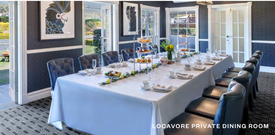
LOCAVORE PRIVATE DINING ROOM