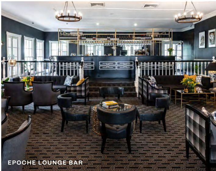
EPOCHE LOUNGE BAR