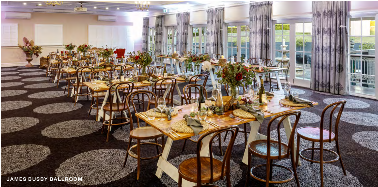
JAMES BUSBY BALLROOM