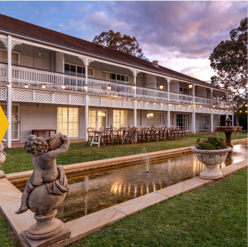
Manor House Estate

With our exclusively yours options, you and your guests can really settle in and make voco™ Kirkton Park your home away from home. With 70 acres, 70 rooms, a restaurant and conservatory, come endless celebratory possibilities.